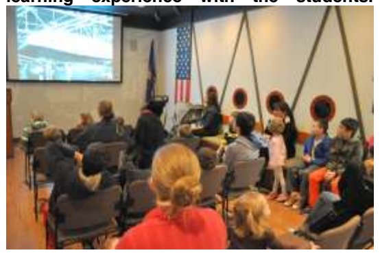
The William "Bruce" Dalton Media Center is in use daily at the museum.

Some class groups as large as 120 students have visited. Our remaining WWII museum volunteers are always a special first person learning experience with the students.